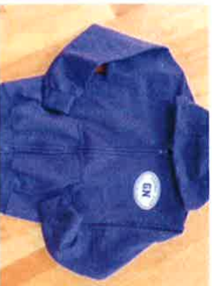
Zip Hoodie shown in Purple