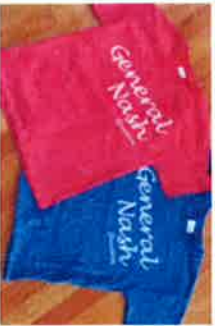
T-Shirt in Royal Blue & Pink