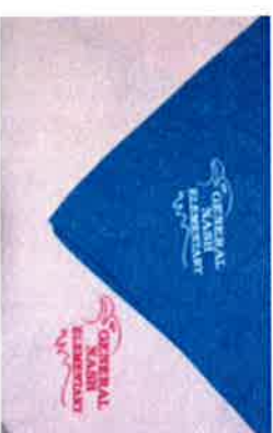
Nash Jersey Blanket