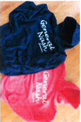
Pullover Hoodies in Navy & Pink